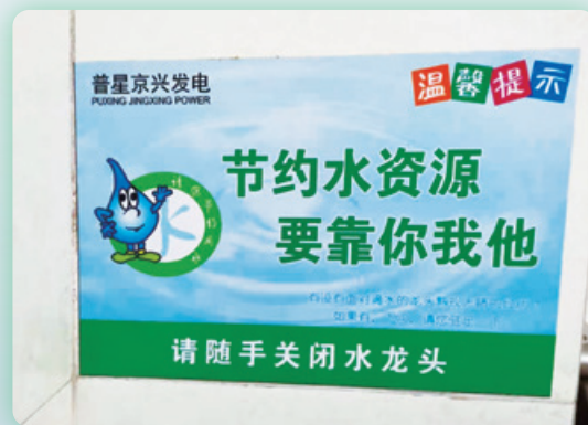
Water-saving Slogan 節水標語

各營運點亦採取不同節水措施減少用水浪費及提升回用率，例如：使用省水的水龍頭、為喉管鋪設保溫物料防止管道破裂，定期監察用水量，以及檢查水龍頭及喉管，如發現任何洩漏則儘快安排維修、粘貼節水標識及宣傳品等。