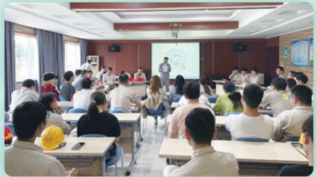
The “Safety Production Month” activity of Anji Power Plant 安吉電廠「安全生產月」活動現場

In order to enhance the safety awareness of all employees and ensure effective response to emergencies which may cause safety risks, the Operating Stations also formulated the emergency plans, such as “Emergency Plan for Fire Safety Incidents”, “Emergency Plan for Emergency Environment Incidents”, “Emergency Plan for Production Safety”, “Emergency Plan for Typhoons, Floods and Strong Convection” and “Emergency Plan for Power Failure”, and carried out drills and provided the employees with relevant safety training on a regular basis. During the Year, the Group has carried out a total of 38 activities, such as emergency drills, Safety Awareness Month and Fire Drill Day, which include several topics such as typhoon and flood prevention, natural gas equipment leakage emergency drills, fire emergency evacuation, and power failure emergency drills, with more than 1,100 participants.