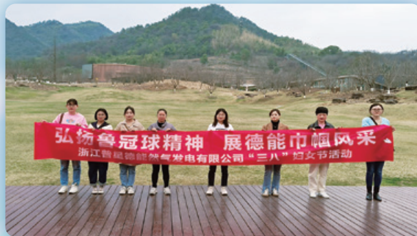
Women's Day activities on 8 March 2023 of Deneng Power Plant 德能電廠二零二三年三月八日婦女節活動