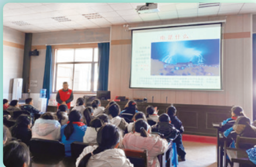
Jingxing Power Plant donated sports supplies for migrant primary schools in December 2022 and conducted a lecture 京興電廠二零二二年十二月於民工小學體育用品捐贈並開展講座