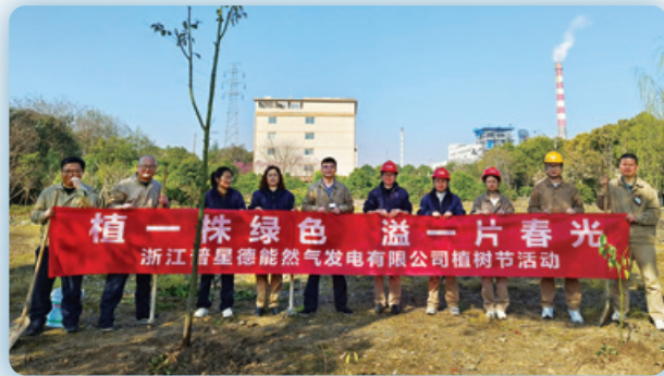
Deneng Power Plant carried out tree planting activities on the Arbor Day in March 2023 德能電廠於二零二三年三月植樹節開展植樹活動