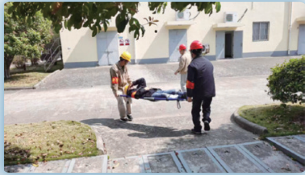
Theme emergency drills conducted by some power plants 各電廠進行主題應急演練