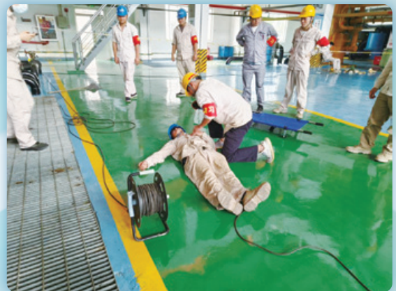
Emergency drill for electric shock rescue 觸電急救應急演練