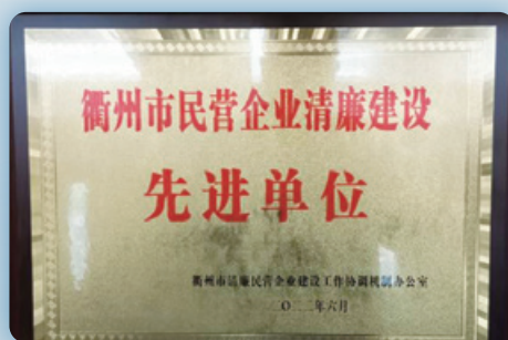
Quzhou Power Plant was honored as an advanced unit of integrity construction among private enterprises 衢州電廠獲評民營企業清廉建設先進單位