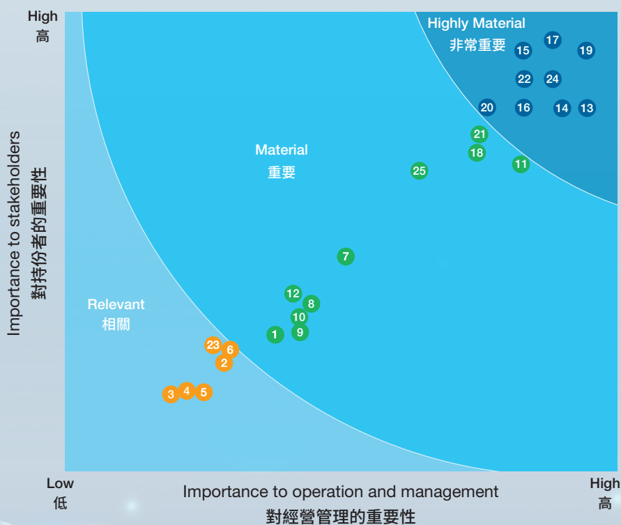
Materiality Issues Matrix for Puxing Energy’s ESG 普星能量ESG重要性議題矩陣

本集團結合自身發展方向、行業特性、各利益相關方回饋及外部專家意見構建ESG議題庫，並通過在線問卷調研誠邀包含管治機構成員與各部門員工在內的內部利益相關方站在「對利益相關方的重要性」和「對經營管理的重要性」兩個維度對25項ESG議題進行打分。根據問卷調查評估結果結合本集團營運實踐及議題覆蓋維度，釐定九項非常重要議題及重要性矩陣（如下圖所示），並於本報告進行重點匯報以及作為日後制定策略的基礎。