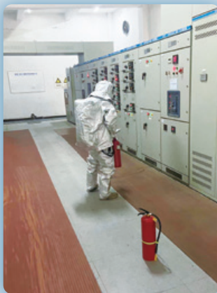
Emergency drill for electrical equipment fire 電器設備著火應急演練

本集團也針對安全生產開展了專項培訓，如安吉電廠為建立開展應急救護培訓的長效機制，進行應急救護員培訓。2023年我們積極進行隱患排查總結，公司、部門、員工層層簽訂「安全生產監督管理責任書」，明確安全生產責任，由此推動完善救護設施，並以季度為單位進行應急演練。