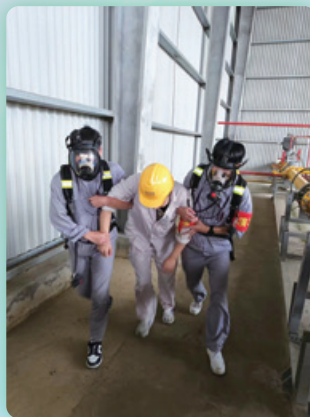
Emergency drill for natural gas leakage accident 天然氣洩漏事故應急演練