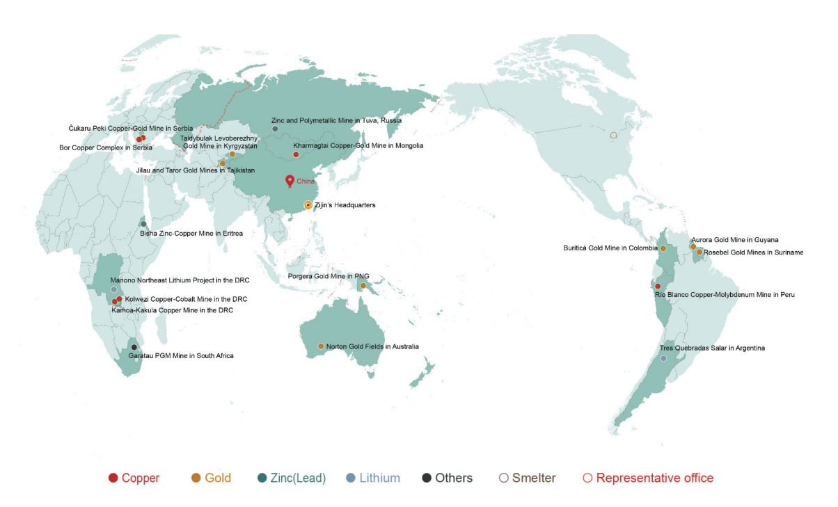
As at 31 December 2023, the Group has more than 30 large and ultra-large mineral resource development bases in 15 overseas countries and 17 provinces (autonomous regions) in China. The following maps set out the locations of the Group's operations worldwide as at 31 December 2023: