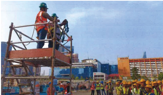
The Grand ToolBox awareness on “Safety Harness and Working at Height” at project site on 23 February 2024.

During the Year, the Group’s ESH Division has initiated and organized several Grand ToolBox Awareness training on specific topic such as “Safety Harness and Working at Height”, “How to use Fire Extinguisher” and etc.