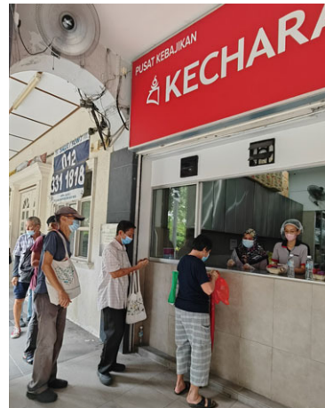
Distributing packed meals 分發盒飯

我們與KSK攜手合作，KSK已經為馬來西亞的無家可歸者和邊緣社區服務超過15年，並主動向在KSK登記的無家可歸者分發盒飯。2023年11月1日，我們加入KSK，為100名有需要的人士分發盒飯。通過共同努力，我們能夠為有需要的人士提供營養及支援，在充滿挑戰的時期帶去一線希望。