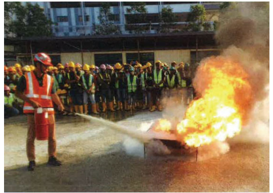
The Grand ToolBox awareness on “How to use Fire Extinguisher” at project site on 22 February 2024.

於本年度，本集團ESH部門已就特定主題發起及舉辦多項Grand ToolBox Awareness培訓，例如「安全帶及高空作業」、「如何使用滅火器」等。