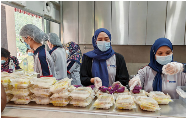
Packing food for distribution 用於分發之包裝食品

We collaborated with KSK (that has been serving homeless and marginalised communities in Malaysia for over 15 years) and volunteered to distribute packed meals to homeless that are registered with KSK. On 1 November 2023, we joined KSK to distribute packed meals to 100 individuals in need. Through our collective efforts, we were able to provide nourishment and support to those in need, offering a glimmer of hope during challenging times.