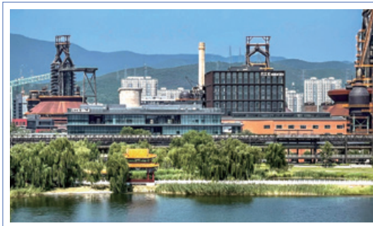
Chang'an Mills project* 六工匯項目

產業園區管理方面，2024年一季度本集團全程主導規劃設計位處北京市順義區的首個定制化服務項目，理想汽車總部二期項目已全面投入使用；2024年二季度為進一步延展本集團管理和持有之資產的服務鏈條，本集團與國貿物業酒店管理有限公司合資設立專注於物業管理業務的非全資附屬公司，構建資產管理循環，夯實和補強本集團的資產營運能力，強化本集團為資產持有者提供全週期的一站式解決方案的能力，助力在管項目經營收益的提升。同時，本集團在管園區招商工作穩步推進，北京市六工匯項目（「 六工匯項目 」）整體出租率已超過95%；2024年一季度新簽的北京市首鋼冬奧廣場項目，已吸引了多家知名企業和平台簽約入駐；在管北京市項目包括融石廣場、首程時代中心等開發進度平穩推進、招商儲備提前佈局。