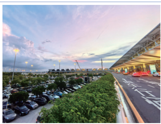
Guangzhou Baiyun Airport Parking Operation Rights Project* 廣州白雲機場停車場經營權項目

本集團高度重視科技投入帶來的營運模式的變革和營運效率的提升。2024年上半年，本集團順利完成了停車管理系統的迭代升級。新版停車管理系統豐富了產品功能，大幅提升客戶端用戶體驗，在穩定性和擴展性方面均有顯著提升，其整體功能更加滿足了本集團停車資產不同產品線的差異化營運需求。本集團將持續推進數智化建設，構建全生命週期停車管理體系，為停車場營運提供全面的專業化、數字化、標準化及智慧化服務。