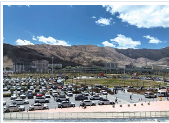
Tibet Lhasa Airport Parking Lot Project* 西藏拉薩機場停車場項目