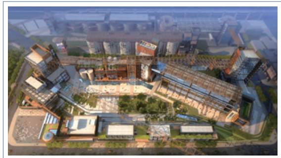
Beijing Shougang Winter Olympics Plaza project* 北京市首鋼冬奧廣場項目