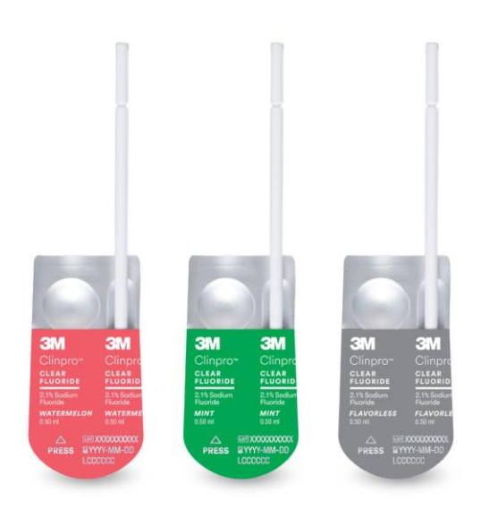
3M<sup>™</sup> Clinpro<sup>™</sup> Clear Fluoride Treatment has a ready release formula that is effective with a contact time of just 15 minutes