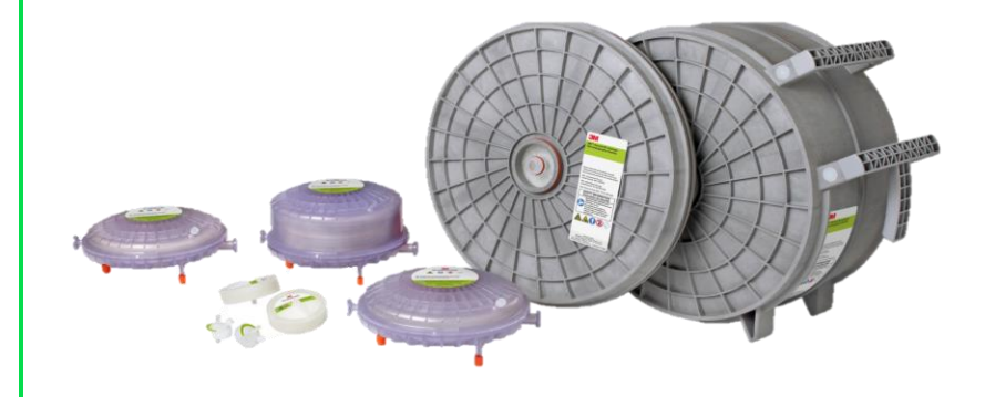
Harvest RC Centrate Chromatographic Clarifier improves biopharmaceutical manufacturing product yields with differentiated technology that enables faster speed to market