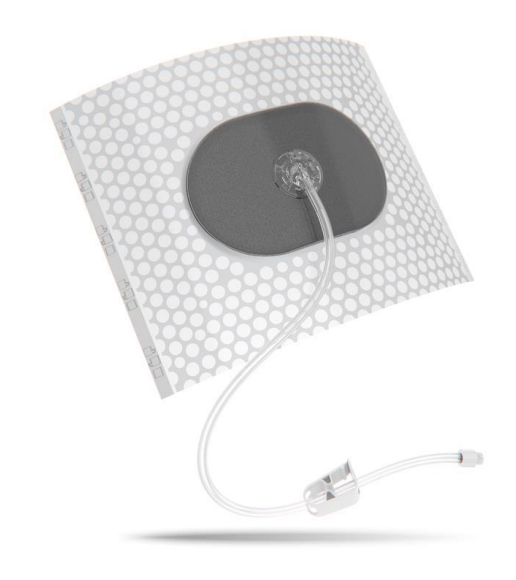
3M<sup>™</sup> V.A.C.® Peel and Place Dressing firstever up to 7-day wear time dressing for 3M<sup>™</sup> V.A.C.® Therapy that can be applied in less than 2 minutes on average<sup>1</sup>