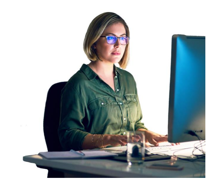
Solventum<sup>™</sup> 360 Encompass<sup>™</sup> Computer-Assisted Coding System combines coding and reimbursement processes along with workflow improvements