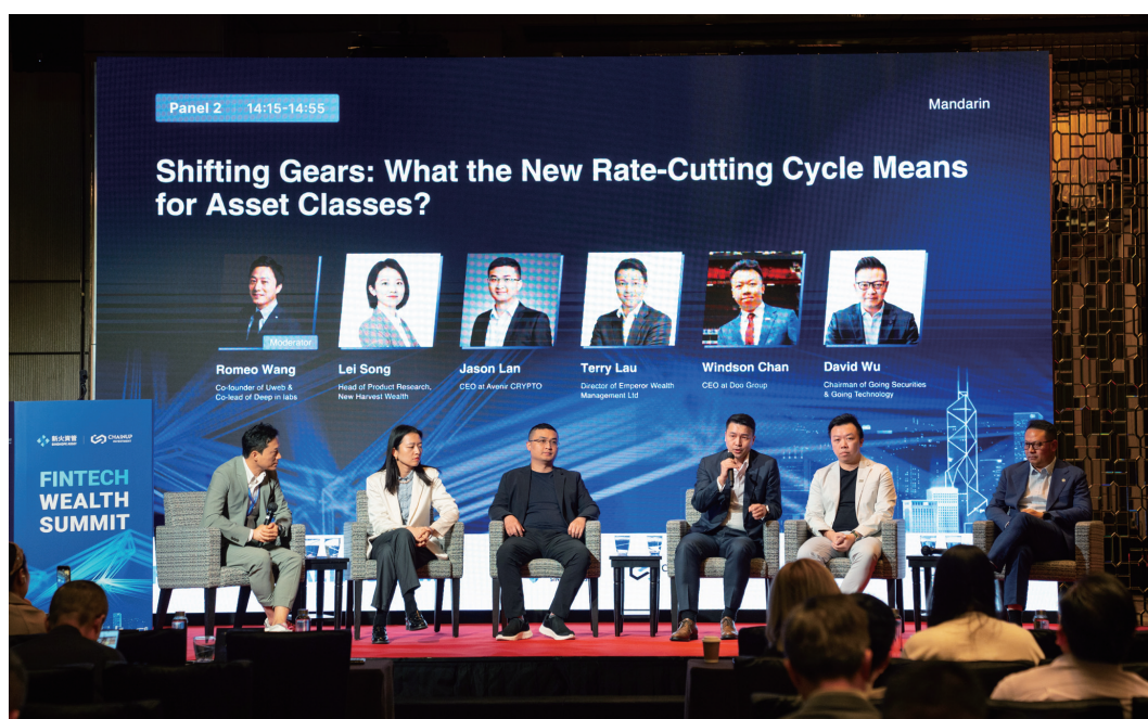
Fintech Wealth Summit 2024

於本年度下半年，隨著4月下旬公佈加強中國內地與香港資本市場的互聯互通措施，投資氣氛有所改善；交易活動回暖及集資活動恢復至一定程度。此外，在美聯儲9月中旬降息的催化劑下，對股市產生正面影響，恆生指數顯著上漲，並於2024年9月30日收報21,133點，為本年度最高水平。