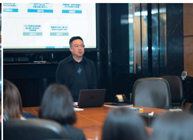
Exchange program on analysing the Hong Kong financial market plus corporate visits 解構香港金融市場及企業考察交流活動