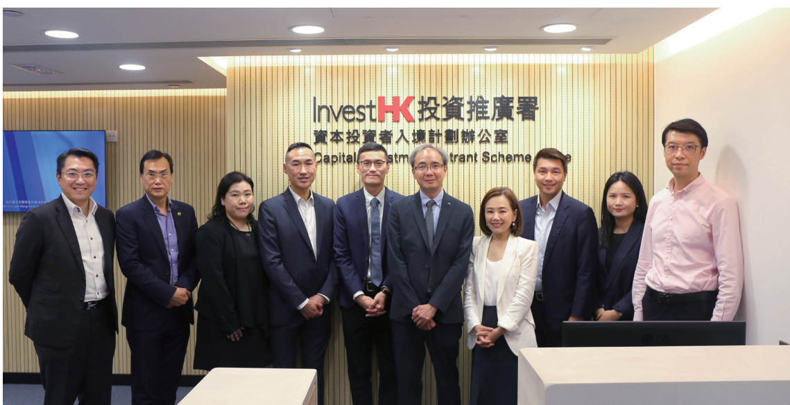
Briefing session of New Capital Investment Entrant Scheme organised by InvestHK 投資推廣署舉辦之新資本投資者入境計劃簡報會

財富管理部門提供平衡的解決方案，協助其高淨值客戶建立量身定制且穩健的投資組合，其中包括保險、基金、債券及股票等多種金融產品。