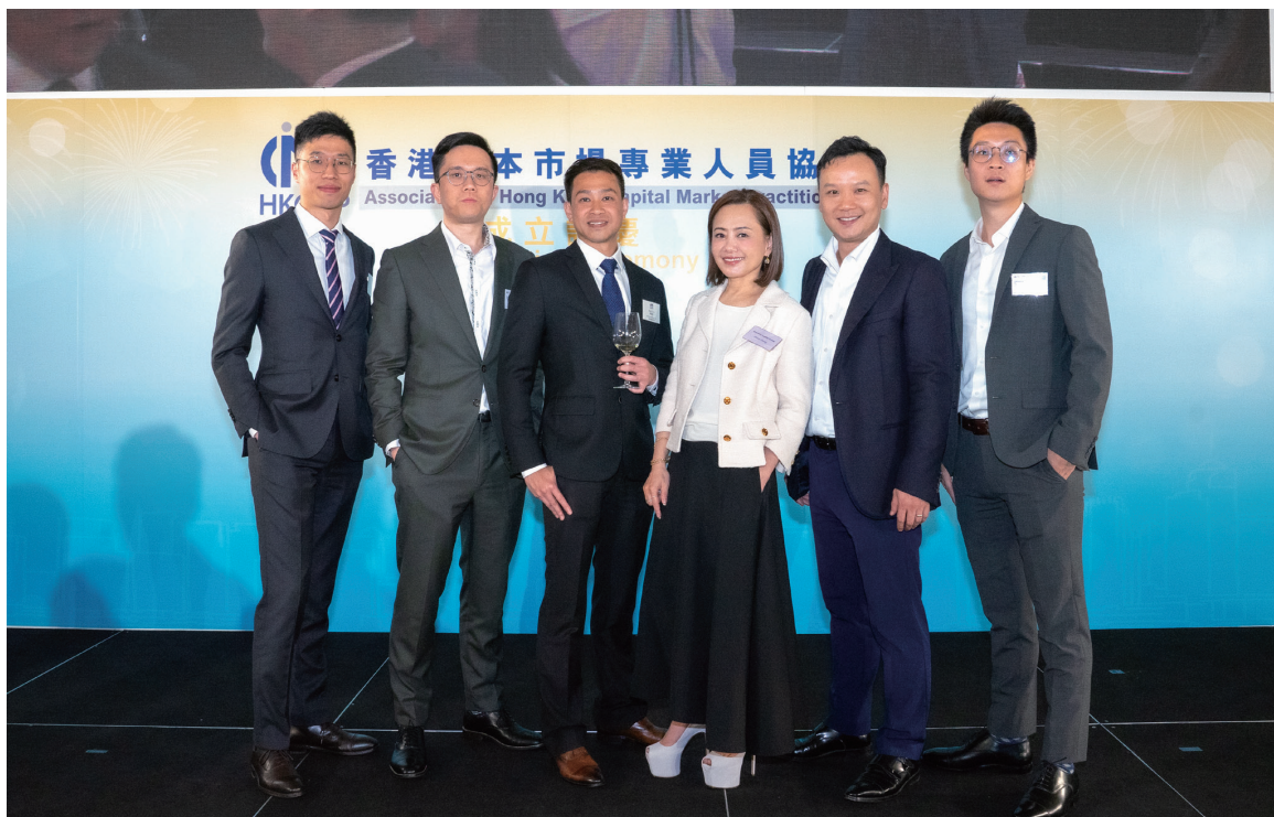
Establishment ceremony of the Association of Hong Kong Capital Market Practitioners 香港資本市場專業人員協會成立慶典

於2024年9月30日，憑藉本集團充裕的銀行結餘及現金以及其可動用但未使用之銀行融資額度1,205,000,000港元（2023年：1,765,000,000港元），董事會認為本集團擁有足夠營運資金，以應付其營運及未來發展所需。