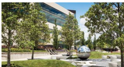
8 CITY BLVD NASHVILLE, TN

Outpatient services are performed efficiently and conveniently