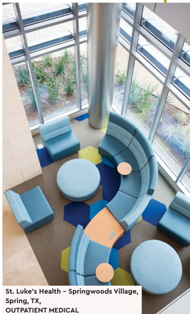
St. Luke's Health – Springwoods Village, Spring, TX, OUTPATIENT MEDICAL

Our CCRC business produced record results in 2024, driven by occupancy growth and rate growth, as consumers appreciate the value proposition of our highly amenitized properties. The business is currently in an upcycle that is benefiting our earnings growth.