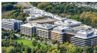
CAMBRIDGE DISCOVERY PARK CAMBRIDGE, MA

New and innovative drugs, therapeutics, and medical devices are developed in our lab properties