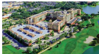
FREEDOM POINTE AT THE VILLAGES THE VILLAGES, FL

Offers seniors an active lifestyle, peace of mind, security, and continuum of care in a highly amenitized campus setting