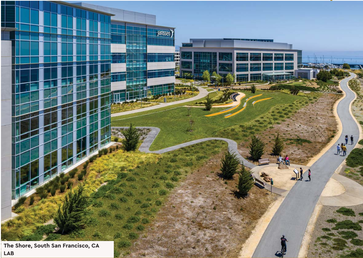
The Shore, South San Francisco, CA LAB