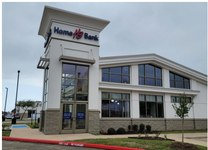
Baybrook Banking Center

In 2024, Home Bank relocated two of our Houston banking centers into prominent locations in Baybrook and Pasadena with the same dynamic team serving our customers and the communities.