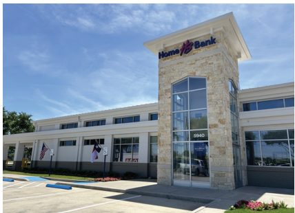
Pasadena Banking Center