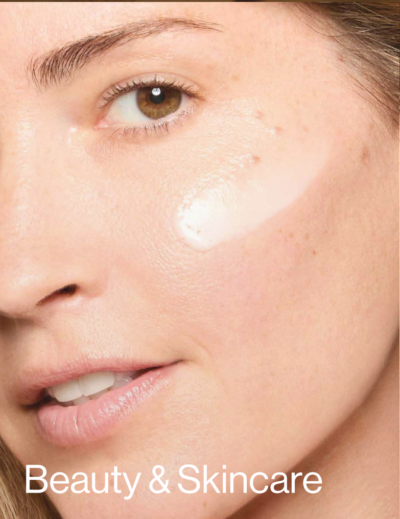
Beauty & Skincare