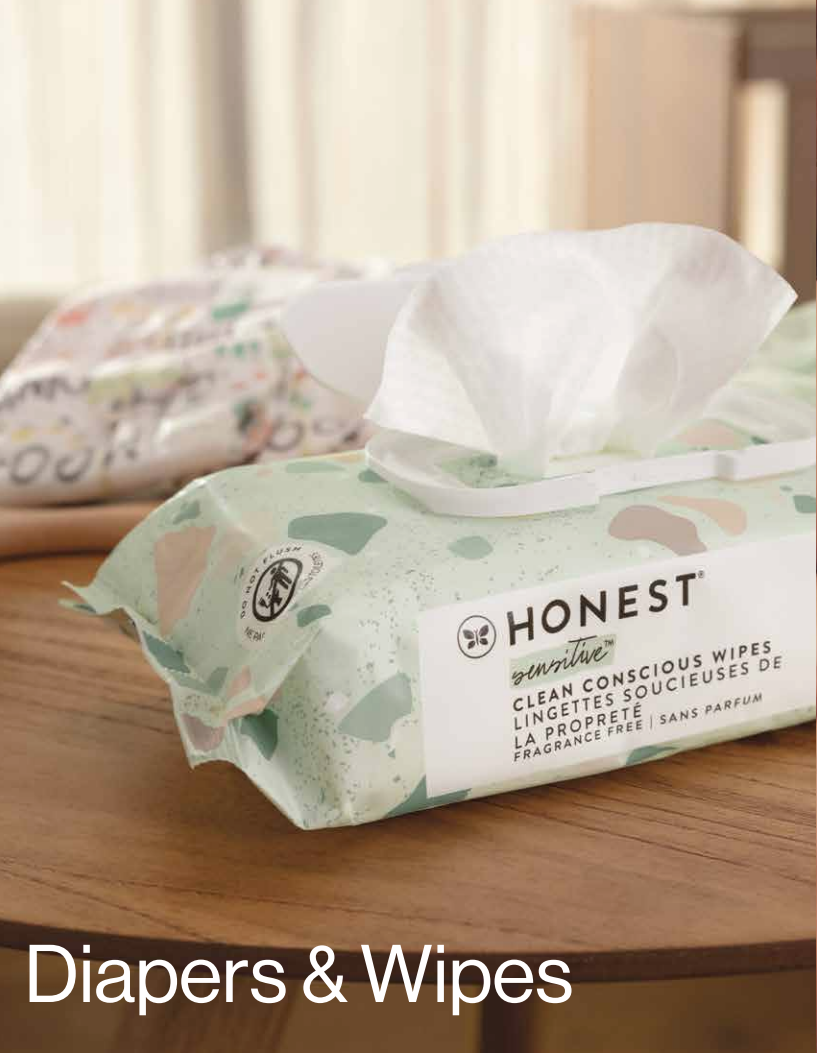
Diapers & Wipes