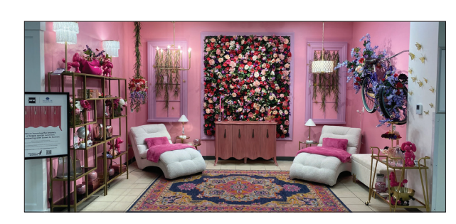
Retail partner Nebraska Furniture Mart created a vibrant display featuring a Hooker Furnishings accent chest giveaway to benefit breast cancer research and education.