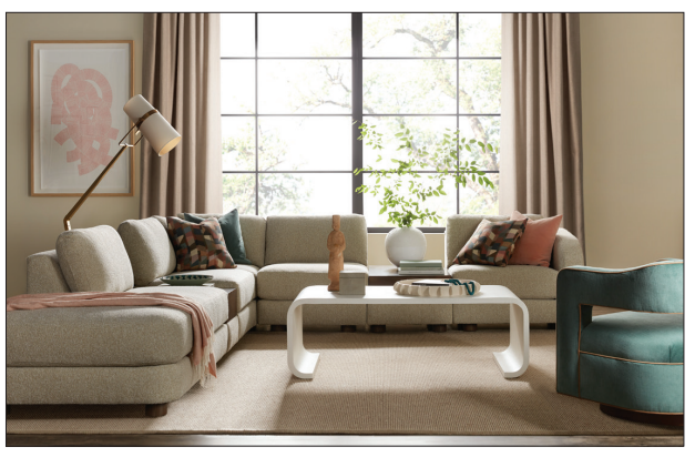
The Venezio Sectional from HF Custom offers customization opportunities for both fabric and wood components and finishes. The group features a sloped track arm and rounded back cushion corners to complement all configurations.

This 2025 Annual Report contains forward-looking statements, including discussions about our strategy and expectations regarding our future performance, which are subject to various risks and uncertainties. Factors that could cause actual results to differ materially from management's projections, forecasts, estimates and expectations include, but are not limited to, the factors described in our annual report on Form 10-K, which is included as part of this report, including under "Item 1- Business—Forward-Looking Statements" and "Item 1A. Risk Factors." Any forward-looking statement we make speaks only as of the date of that statement, and we undertake no obligation, except as regulted by law, to update any forward-looking statements whether as a result of new information, future events or otherwise.