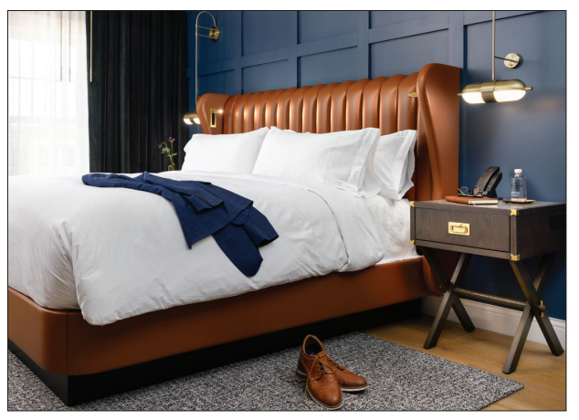
Set in historic downtown Fredericksburg, VA, The Publisher, a Tribute Portfolio Hotel, exudes charm from its days as a publishing house. SLH executed original designs for channeled beds, casegoods, beverage center, and stone.