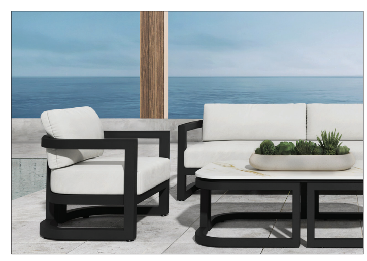
Deco-inspired elegance meets contemporary sophistication in the Malibu Collection by Sunset West, expertly hand-welded to deliver seamless joinery and constructed with durable powder-coated aluminum in a sleek, matte coal finish.