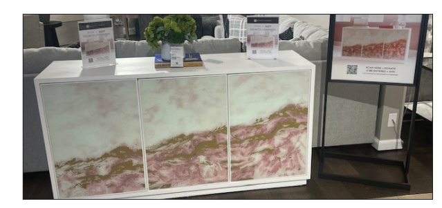
Partnering with Hooker in an Act of Kindness, Oklahoma-based Mathis Home featured a giveaway of a Hooker Furnishings accent chest to promote breast cancer awareness.