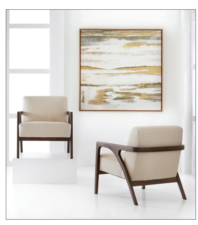
The STAFFORD CHAIR from H Contract is a conversation piece in every sense; it exudes modern craftsmanship with its curved wood back legs, wrap-around wood back and stretcher. The silhouette is clean yet striking with a plush tight seat and back.