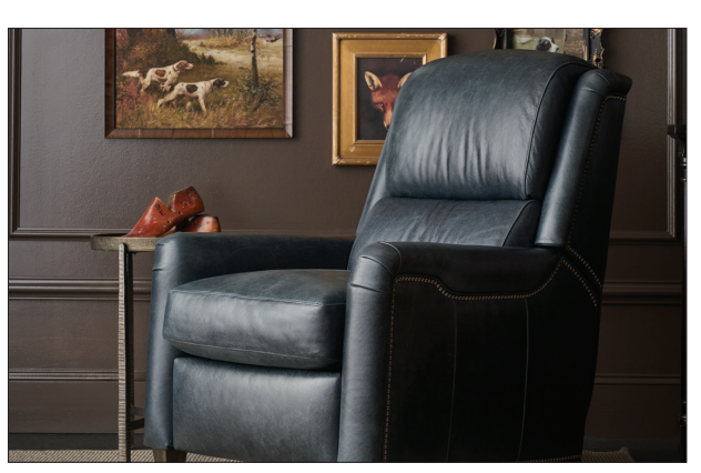
The Kyler 3-Way Lounger from Bradington-Young, a topselling introduction this year, is a smaller-scale recliner characterized by English arm styling, nailhead details and a two-piece back.