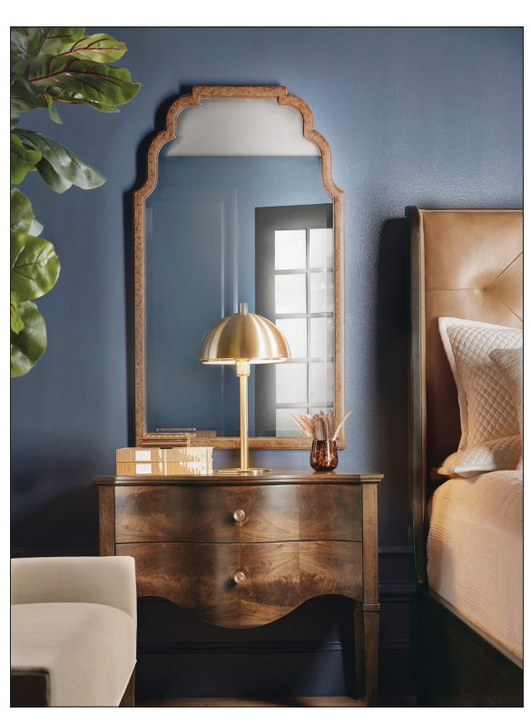
Archives taps into a design trend mixing modern and trending styles with historic elements. The 37-piece collection layers rich and authentic materials such as figured walnut veneers, top grain leather, woven raffia and polished marble.

• Invest in long-term value creation, not short-term optics