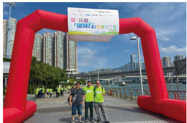
Caring and Inclusion “Disability Walk” Charity Walk 2024 關愛共融「健障行」慈善步行樂2024

本集團捐贈總額約122,000港元，用於支持香港的體育發展、建築業及香港的低收入家庭。