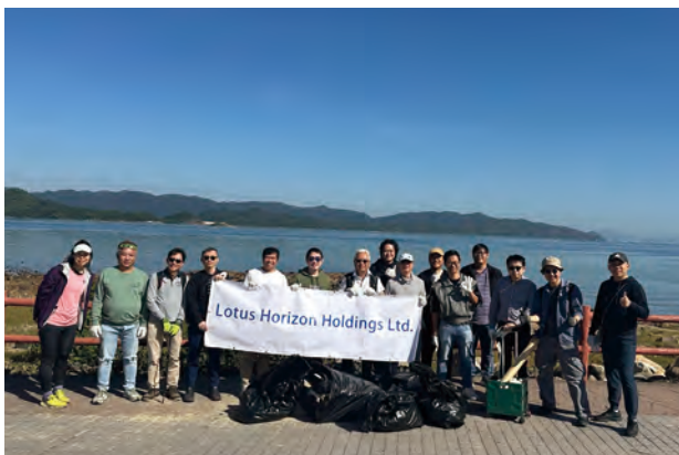
Beach Clean-up Activity 海灘清潔活動

The Group’s donation amounted to approximately HK$122,000 in total, for the purpose of supporting sports development, the construction industry in Hong Kong and low-income families in Hong Kong.