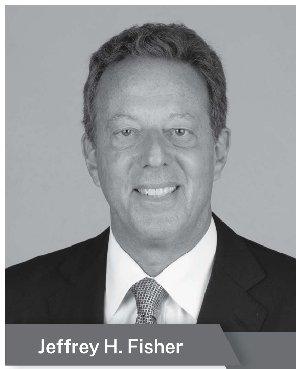
Chairman, Chief Executive Officer and President