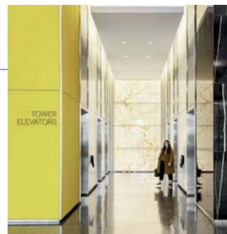
Images from top to bottom (L to R): Solaris House at Uptown ATX, Austin, TX; Logan Square Cafe & Lounge at Logan Square, Philadelphia, PA; Lobby at One Uptown, Uptown, Austin, TX