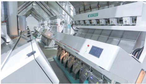
Our rice production lines 我們的大米生產線

我們不斷改良我們的生產工序，以及探索開發我們的生產技術和工藝，使我們的產品保持良好的口感及營養價值，滿足目標消費者的喜好。我們的生產流程高度標準化及自動化。此外，我們已大量投資購買先進的生產機器及設備，我們的生產團隊成員亦緊密合作，持續維護我們的生產機器及設備，以滿足我們嚴格的生產標準並提高生產效率。截至2025年12月31日，我們已在中國六個核心糧食產區附近建成七個現代化生產基地，分別為瀋陽新民生產基地、五常大米生產基地、五層牛家玉米生產基地、松原生產基地、通河生產基地、敖漢生產基地及南寧生產基地。