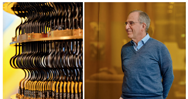
Michel Devoret, Google Quantum AI’s Chief Scientist of Quantum Hardware, is a 2025 Nobel laureate alongside former Quantum AI hardware lead John Martinis, and John Clarke of the University of California, Berkeley.

Our deep computer science roots are accelerating discoveries, from our Gemma models being used for cancer research to our Willow quantum chip, which achieved a new milestone last year with the first verifiable instance of a quantum computer outperforming a regular supercomputer on a computation that paves the way for future practical applications. This momentum in quantum computing is built on foundational science, highlighted by our chief scientist for quantum hardware, Michel Devoret, being awarded the Nobel Prize in Physics for his early research—the third Googler to receive a Nobel Prize in just the last two years. →