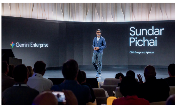
Google CEO Sundar Pichai announces Gemini Enterprise at Google Cloud's Gemini at Work event in October 2025.

Our Gemini App has seen incredible growth, reaching over 750 million monthly active users by the end of 2025. In Q4 2025, we announced that nearly 75% of Google Cloud customers had used our vertically optimized AI. At that time, we had sold more than 8 million paid seats for Gemini Enterprise in only a few months' time. Beyond our core platforms, Waymo's momentum is in overdrive, surpassing 20 million fully autonomous trips in December 2025, as it looks to expand to new cities across the U.S., UK, and Japan. Wing and Isomorphic Labs are also tackling important challenges, and we continue to manage and invest in Other Bets responsibly.