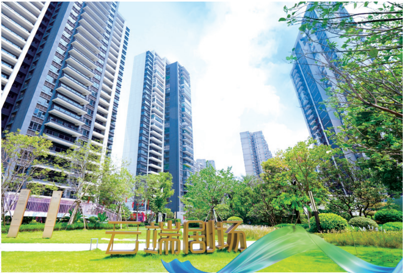
Jiangmen Yuzhou Langham Cloud Land 江門 禹洲·朗廷雲澤

禹洲集團多年來始終堅持低碳環保和綠色發展的理念，高度重視可持續發展，並主動響應國家「雙碳」目標，以「匠心」打造綠色精品項目，不斷加大對綠色建築的實踐，力求構築人與自然和諧共處的生態小區。「環保節能，建設綠色家園」一直是禹洲集團項目開發理念之一，截至2025年12月31日，本集團旗下共有145個項目超2,100萬平方米物業達到綠色建築標準，其中約555萬平方米物業更是達到綠色建築二星級及以上級別的國內或國際標準。