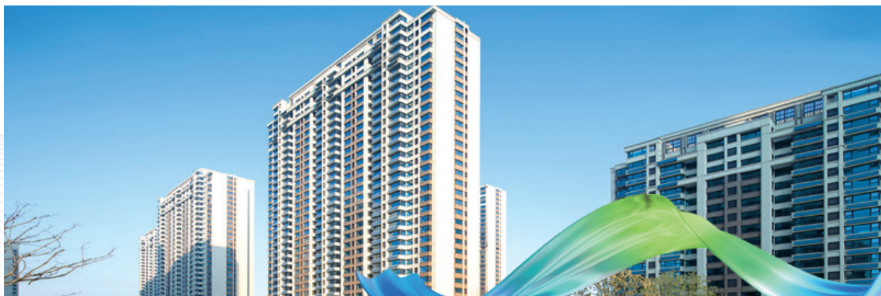
Hefei Yuzhou Central Town 合肥禹洲·中央城

在行業整體處於下行磨底的困難階段，禹洲集團全體同仁依然不畏艱難險阻，努力拼搏奮鬥，積極跟蹤市場動態，結合最新政策及項目實際情況，迅速制定有針對性的營銷方案，搶抓搶收，為公司銷售打下堅實基礎。儘管公司採取了多樣化營銷策略，員工齊心合力、奮力拼搏，但全年銷售表現亦不及預期。2025年，禹洲集團實現合約銷售金額為人民幣67億2,833萬元，同比下降15.40%。合約銷售面積為487,999平方米，同比下降10.59%；合約銷售均價約為每平方米人民幣13,788元，同比下降5.38%。銷售額的持續下滑，使得公司原本捉襟見肘的現金流愈發艱難，資金鏈愈加緊張。融資方面，公司近幾年幾乎沒有新增銀行借款來補充項目開發、運營資金，而公司存續的借款，仍需按照相關借款合同之約定償還大量的本金及利息。2025年8月29日，在絕大多數境外美元債投資者的支持下，禹洲集團境外美元債重組完成，對公司的債務結構有所優化，也緩解了公司部分現金流壓力，在此，禹洲集團對投資人的大力支持和理解表示萬分感謝。自2022年開始，為緩解公司持續的現金流緊張壓力，公司亦採取了諸如暫停拿地、組織架構調整、人員優化、縮減辦公面積、資產處置與盤活等降本增效措施，但相比於項目的工程款開支、銀行借款的本息償還等公司運營之硬性開支，禹洲集團依然面臨很大的現金缺口，資金壓力仍然沒有得到有效緩解。