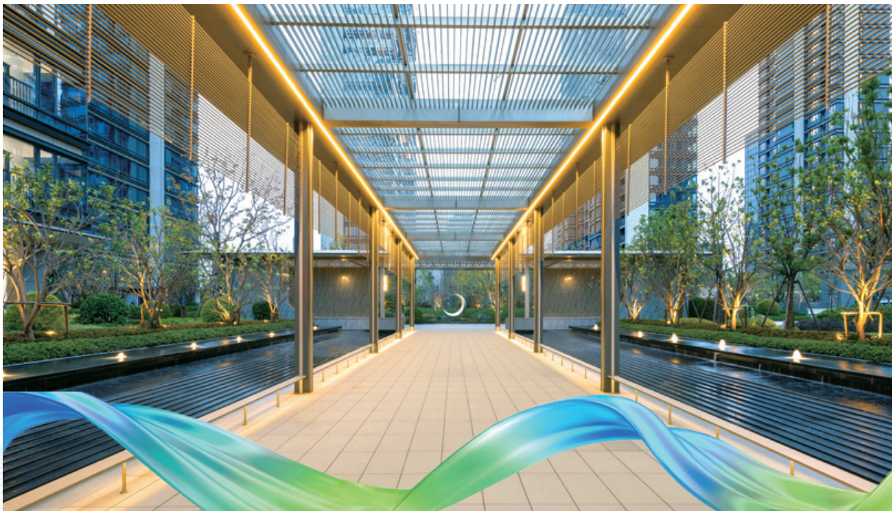
Shaoxing Yuzhou Yinyue Mansion 紹興 禹洲·印樾府

本集團的收入主要來自物業銷售、投資物業租金收入、物業管理收入及酒店運營業務四大業務範疇。2025年，本集團的總收入為人民幣67億5,131萬元，較去年同期下降30.52%，主要原因是年內交付物業面積減少，令物業銷售確認收入有所下降。其中，物業銷售收入約為人民幣62億9,695萬元，較去年下降31.75%，佔總收入的93.27%；物業管理費收入約為人民幣2億2,499萬元，較去年同期下降15.83%；投資物業租金收入約為人民幣2億2,492萬元，較去年同期增加1.56%；酒店運營收入約為人民幣445萬元。