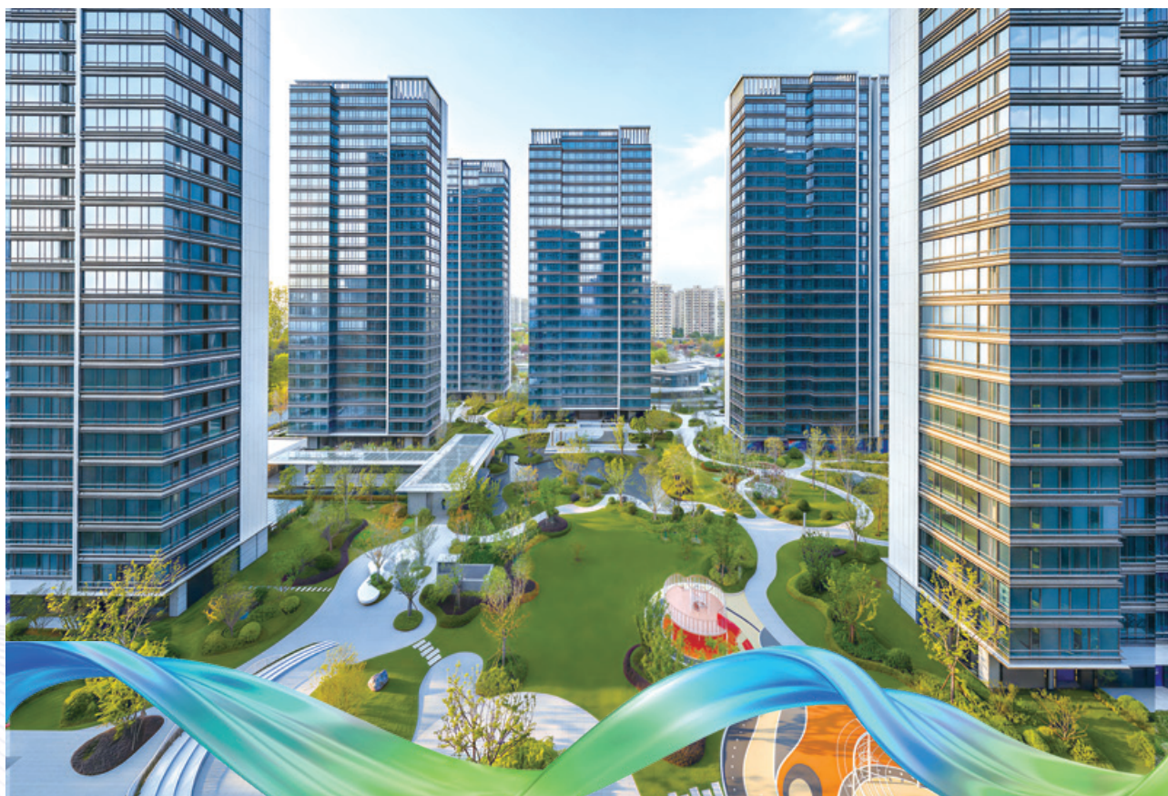
Shaoxing Yuzhou Yinyue Mansion 紹興禹洲·印樾府

年內，本集團的收入為人民幣67億5,131萬元，按年下降30.52%。年度本公司擁有人應佔利潤為人民幣249億3,048萬元，如撇除一次性境外債務重組收益人民幣326億2,130萬元及重新計量財務擔保合約之收益人民幣20億2,710萬元的影響，則2025年本公司擁有人應佔虧損為人民幣97億1,793萬元。總權益為人民幣100億5,683萬元。董事會不建議派發截止2025年12月31日止年度之末期股息。