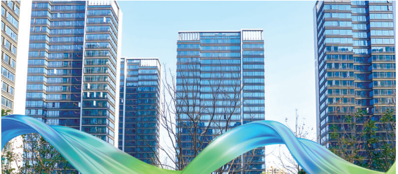
Shaoxing Yuzhou Yinyue Mansion 紹興 禹洲·印樾府