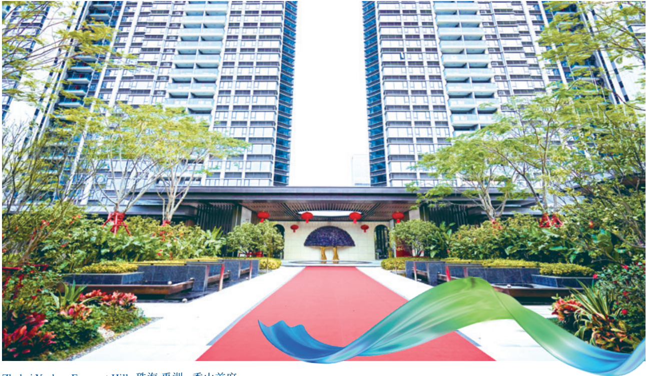
Zhuhai Yuzhou Fragrant Hills 珠海 禹洲·香山首府