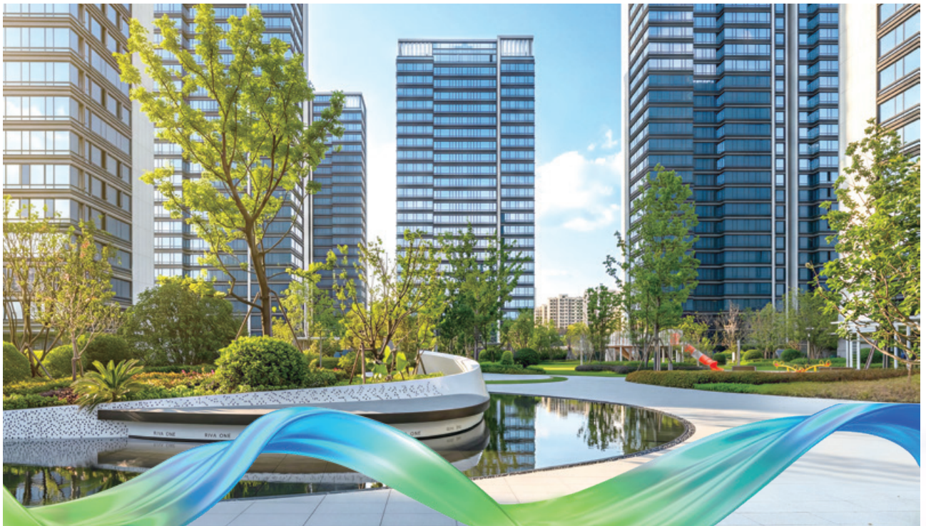
Shaoxing Yuzhou Yinyue Mansion 紹興禹洲·印樾府

本集團2025年的所得稅抵免為約人民幣3億5,883萬元，2024年的所得稅開支為人民幣1億1,457萬元。所得稅費用減少主要由於年內遞延稅項抵免增加所致。