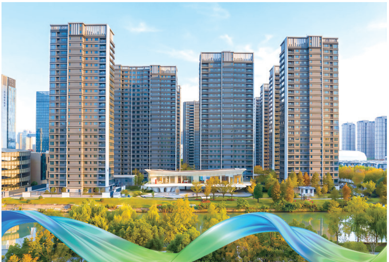
Shaoxing Yuzhou Yinyue Mansion 紹興 禹洲·印樾府

2025年，集團旗下酒店採取多樣化、創新性的經營及管理模式，不斷優化現有運營管理體系，對品牌進行升級改造的同時，注重服務品質、消費者體驗及客戶口碑的提升，持續為集團創造更多的收入增長空間。年內，該業務板塊為集團帶來收入約為人民幣445萬元。此外，廈門同安嘉美倫溫泉酒店、泉州惠安嘉美倫商務酒店、合肥肥東酒店、武漢太子湖酒店及上海奉賢金匯酒店等也在籌建中。集團將始終秉承「如同家人般照顧您」這一服務理念，為住客帶來高品質的服務體驗。