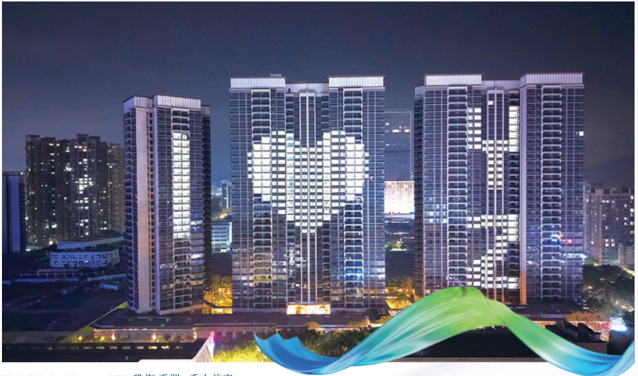
Zhuhai Yuzhou Fragrant Hills 珠海 禹洲·香山首府

本集團的物業銷售確認收入在區域分佈上，包括華中區域、長三角區域、粵港澳大灣區（「大灣區」）、環渤海區域、西南區域及海西經濟區，分別貢獻確認收入金額的32.21%、27.90%、20.89%、12.49%、3.29%及3.22%。未來，集團將繼續秉持著「區域深耕」的戰略，優化重點區域發展，為集團帶來更加持續的收入貢獻。