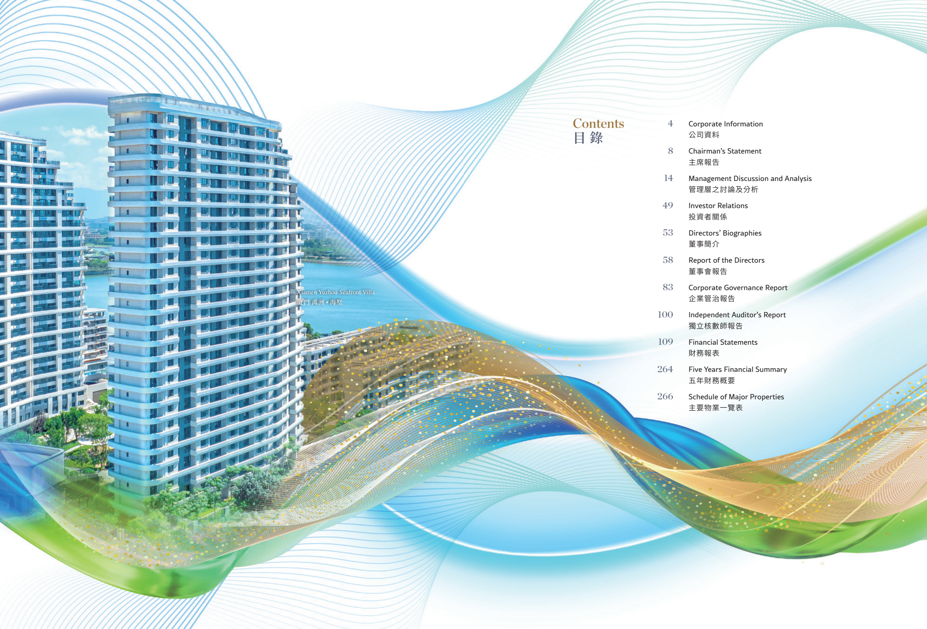
Xiamen Yuzhou Seafront Villa 廈門 禹洲·海墅