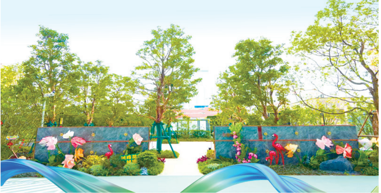
Zhuhai Yuzhou Fragrant Hills 珠海 禹洲·香山首府

Amidst the ongoing challenges within the real estate industry, Yuzhou Group rose to the occasion by steadfastly upholding its corporate mission of “guaranteeing project completion, guaranteeing housing delivery” in 2025. Throughout the year, it brought over 30 batches of projects to completion and handover, delivering tangible results that honored its commitments. This demonstrated sincere dedication to both homeowners and the wider community. Adhering to its core strategy of “guaranteeing project completion, guaranteeing housing delivery, efficiency improvement, and stable operations”, Yuzhou Group consistently implemented the “Yuzhou Well-pleasing 1628” Delivery Guarantee System and steadfastly enforced the “631” construction management and control system by prioritizing the enhancement of “product, delivery and service”. Yuzhou Group always maintains an unwavering customer-centric philosophy, with meticulous attention to detail and uncompromising quality standards. From project planning to construction to final delivery and acceptance, rigorous quality control has been maintained across all project phases to ensure that the delivered products live up to the trust and support of customers.