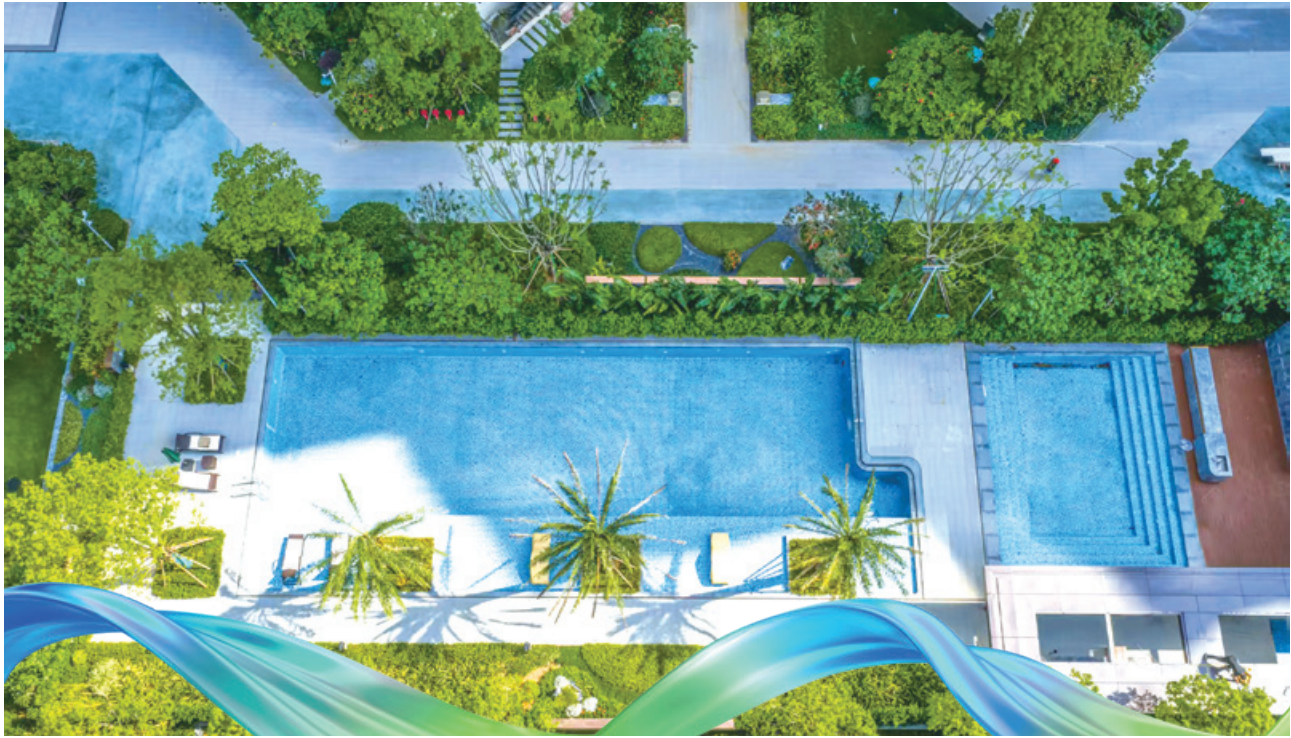
Zhuhai Yuzhou Fragrant Hills 珠海 禹洲·香山首府