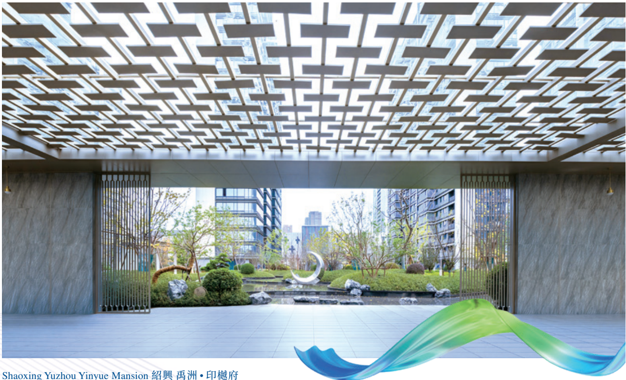
Shaoxing Yuzhou Yinyue Mansion 紹興 禹洲·印樾府

化，約66.8億美元債務得以化解，這將使本公司能夠實現可持續之資本結構，以應對其長期業務營運，並降低本集團持續營運之風險。鑒於中期票據及長期票據之期限介乎四至十年，概無中期票據及長期票據於發行後於本集團財務報表中分類為流動負債。建議重組所造成之債務削減將大幅改善本集團之總體財務狀況，並減輕本集團之即時流動資金壓力。有關建議重組的詳情，請參閱本公司日期為2024年12月13日的通函及重組生效日期公告。建議重組產生一次性，非現金性及非主營業務境外債務重組的收益326億2,130萬元。