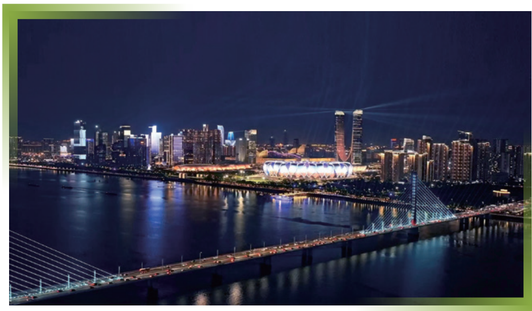
Hangzhou•International Office Centre (IOC) 杭州•國際辦公中心

商業地產開發方面，杭州IOC潮鴻項目被評為「2025-2026年江景大平層三冠王」，為集團提供了穿越週期的穩定盈利能力。在商業運營方面，中國新城市成功打造蕭山眾安廣場、餘姚眾安廣場、眾安里•嘉潤公館等標杆項目，並創新推出溫州龍港未來社區、西溪未來產業園等產城融合模式，實現多元化業態協同發展。在存量資產價值提升與輕資產模式創新雙重驅動下，中國新城市持續深化戰略佈局，通過「空間+運營+內容」全鏈路模式，全年客流量突破1700萬人次，其中蕭山眾安廣場客流量同比激增約12%，餘姚項目同比增長約8%。酒店營運方面，伯瑞特酒店集團秉持「中高端住宿業領域具行業競爭力品牌」的戰略定位，持續擴大伯瑞特品牌管理輸出，新增5個委託管理項目形成覆蓋高端商務酒店、度假酒店及主題酒店的多元產品矩陣，進一步強化輕資產管理模式。面向未來，酒店管理業務板塊將以「品牌價值賦能+數智化運營」為核心戰略，持續探索「酒店+」業態創新，通過產品迭代與服務升級構建市場競爭新優勢。