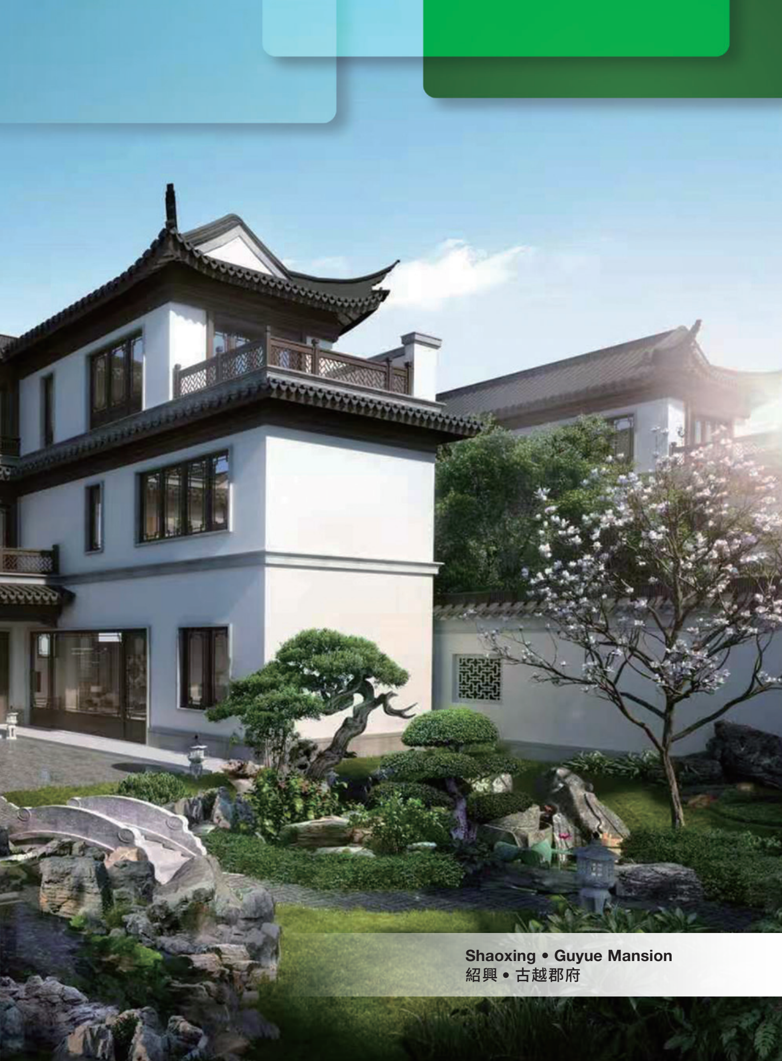
Shaoxing • Guyue Mansion 紹興 • 古越郡府