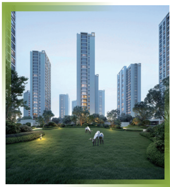
Shaoxing • Future City 紹興 • 未來社區