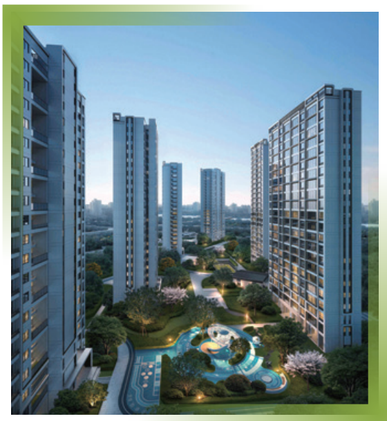
Shaoxing • Future City 紹興 • 未來社區