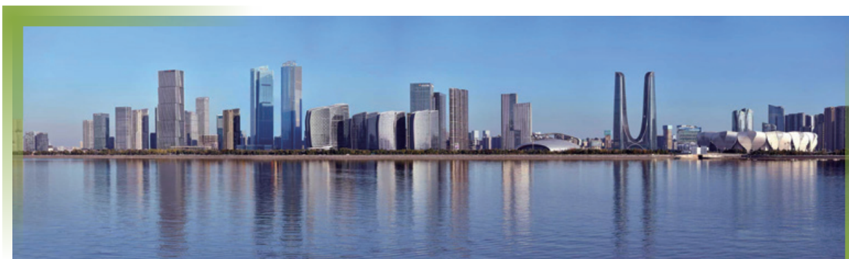
Hangzhou•International Office Centre (IOC) 杭州•國際辦公中心

It is located in Daicun Unit, Xiaoshan District, Hangzhou. It consists of high rise buildings, with a total floor area of approximately 39,973 sq.m. and a total GFA of approximately 71,951 sq.m., which is for residential use. The project commenced construction in the second quarter of 2022 and started the pre-sales in the fourth quarter of 2022, and was completed and delivered in the first quarter of 2025. The volume of sales of the project during the year under review was in line with expectation. So far, it has been basically sold out apart from a small number of housing units and car parking lots.