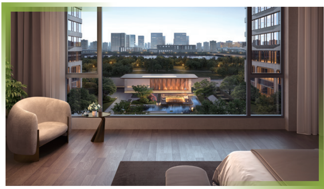
Hangzhou • Zi Jin Mansion 杭州 • 紫金蘭軒

位於杭州市餘杭區未來科技城，由多層組成，總佔地面積約46,737平方米，總建築面積約78,087平方米，作住宅用途。該項目於2021年第一季度開工，於2021年第三季度啟動預售。於2023年竣工。於回顧年度，該項目銷售符合預期。截至目前，除部分車儲外，已基本售罄。