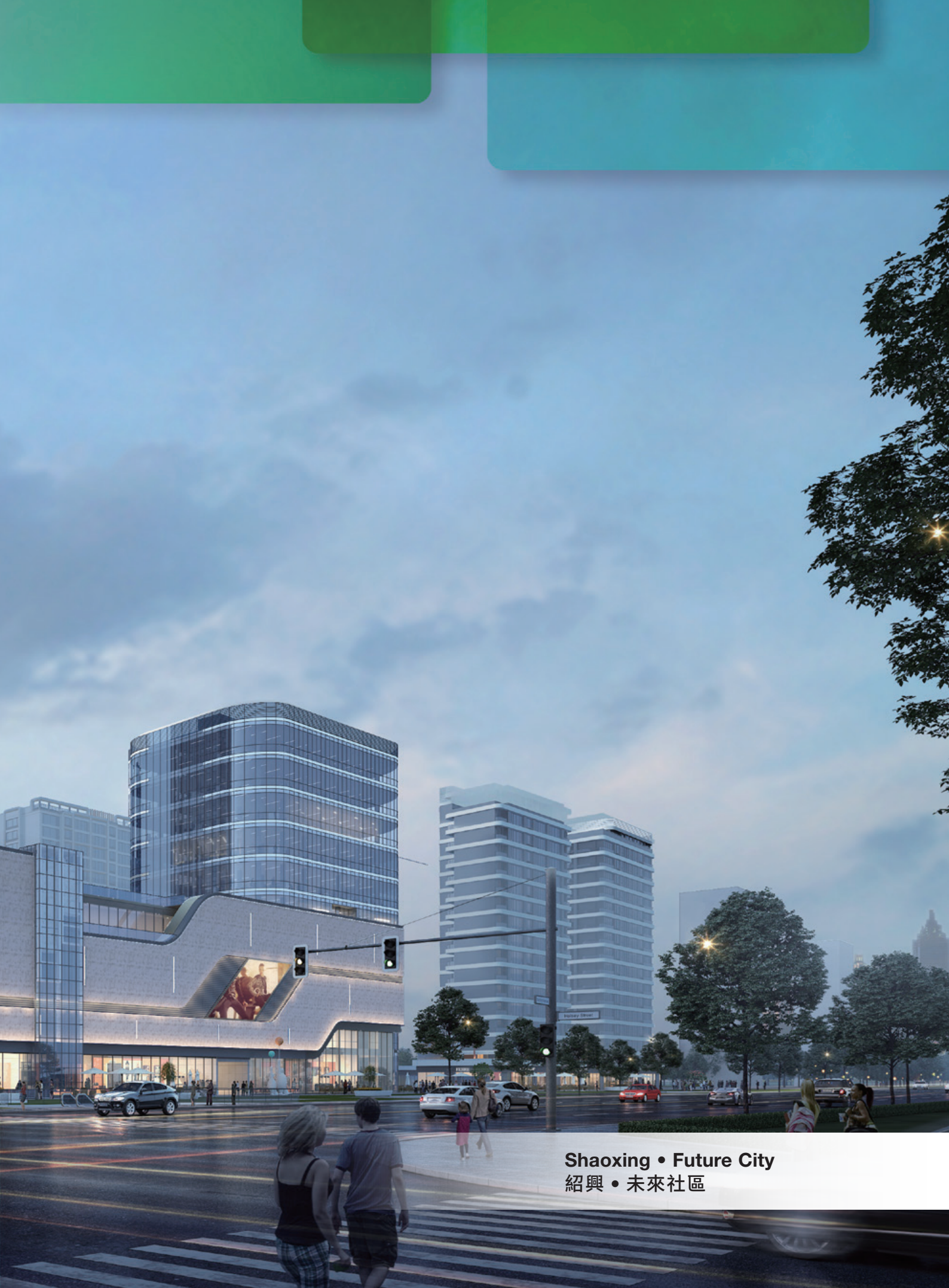
Shaoxing • Future City 紹興 • 未來社區