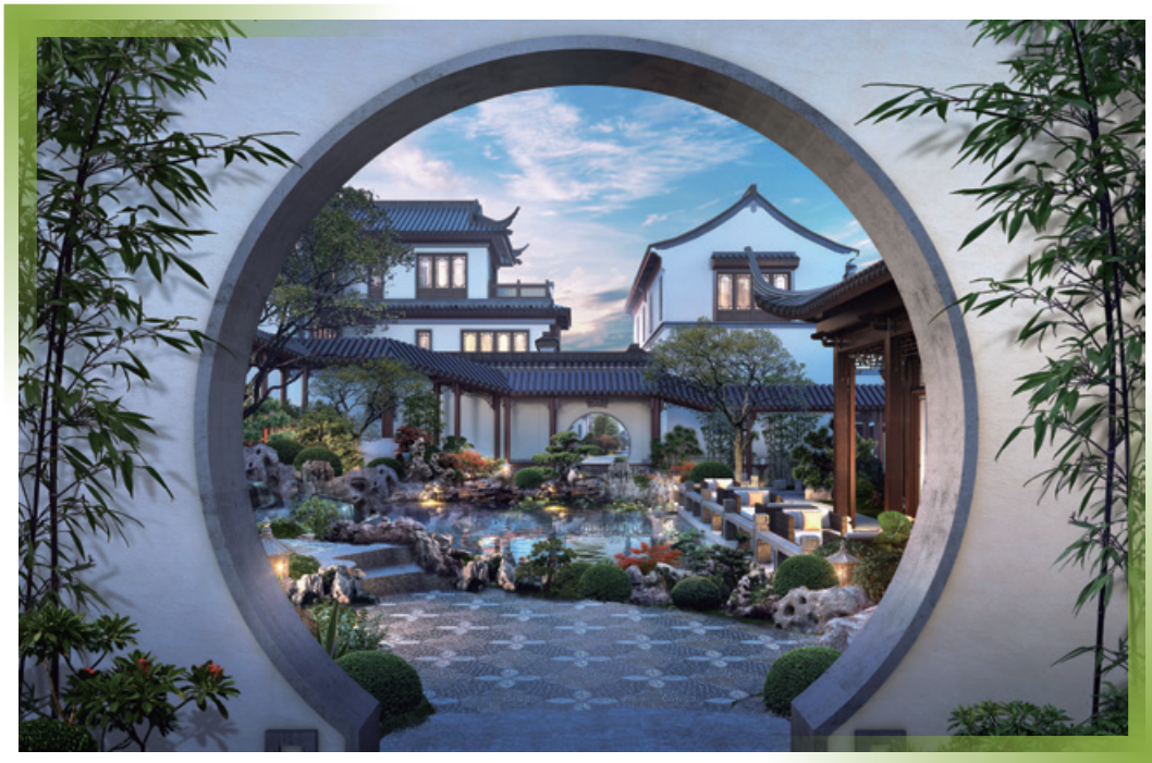
Shaoxing • Guyue Mansion 紹興 • 古越郡府

此為於加拿大英屬哥倫比亞省溫哥華市的項目，總建築面積約7,719平方米。位於富有區域，離溫哥華市中心大約20分鐘車程。共有12棟獨立屋，並備有獨立游泳池和豪華設計，將分為3個階段建築，建築工程自2016年開始，現已完成3棟獨立屋的建設，後續樓棟方案調整報批中。