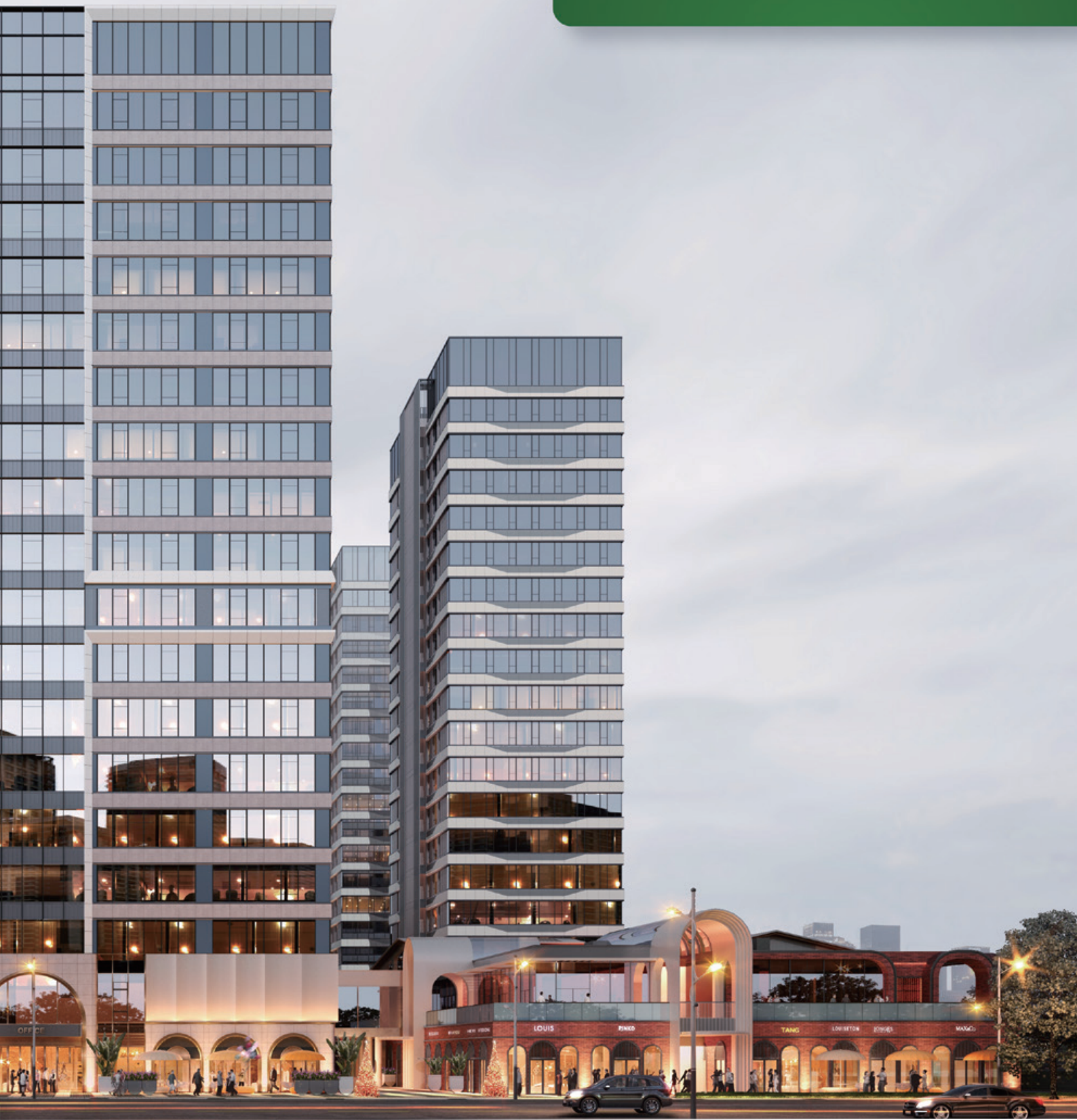
Hangzhou • Zi Jin Mansion 杭州 • 紫金蘭軒