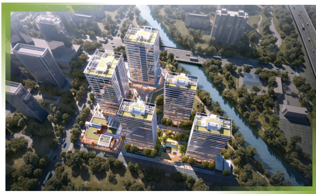
Hangzhou • Zi Jin Mansion 杭州 • 紫金蘭軒

2025年是「十四五」規劃的收官之年，中國房地產市場經歷了從政策持續寬鬆到信心逐步修復的過程，行業亦逐步築底回升，邁向新發展模式。2025年，杭州土地市場表現優異，顯示出市場對杭州核心資產價值的高度認可。根據中指研究院數據顯示，2025年杭州全市（含十區及三縣市）涉宅用地成交總金額達人民幣1,425.3億元，同比增長約21.5%，位居全國城市首位。全年共出讓涉宅地塊92宗（十區），成交建面約624萬平方米，同比上升15%。尤為引人注目的是杭州土地市場的熱度，全年平均溢價率維持在30%的高位。作為在杭州深耕近30年的企業，面對行業分化與調整，本集團始終堅持「穩中求進」的總基調，憑藉卓越的產品力和服務、優質充裕的低成本土地儲備、穩健的財務狀況，以杭州為核心區域的深耕佈局，持續穿越週期，構築了堅實的護城河，整體經營狀況保持平穩。