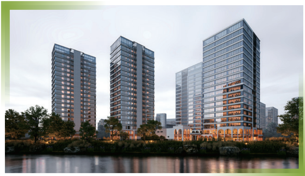
Hangzhou • Zi Jin Mansion 杭州 • 紫金蘭軒

位於紹興市主城區城西地塊，由合院及商鋪組成，總佔地面積約43,412平方米，總建築面積約52,528平方米，作住宅用途。項目於2020年第三季度開工，於2021年第一季度啟動預售，於2023年竣工。於回顧年度，該項目銷售符合預期。