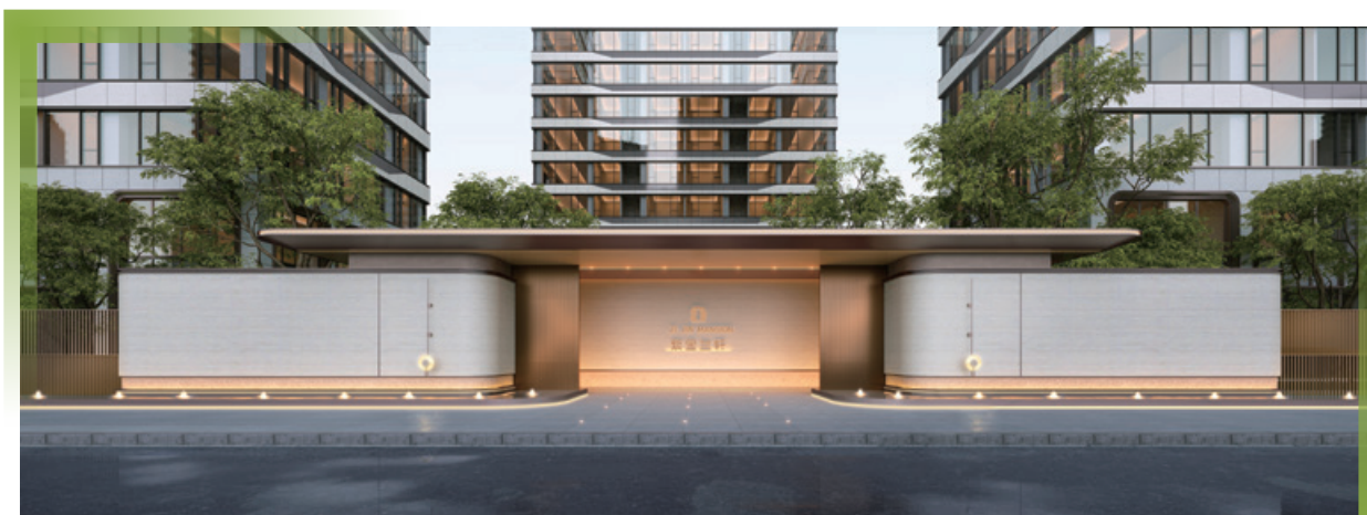
Hangzhou • Zi Jin Mansion 杭州 • 紫金蘭軒

2025財年，本集團已確認每平方米銷售均價約為人民幣17,456.8元，較2024財年的約人民幣18,744.4元降低約6.9%。