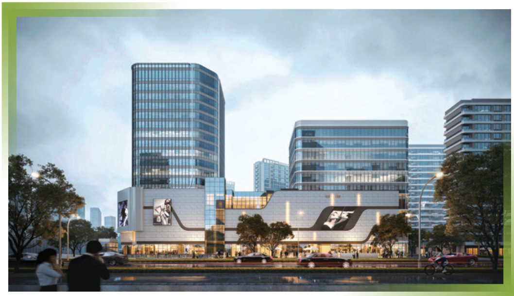
Shaoxing • Future City 紹興 • 未來社區