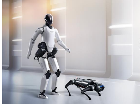
图 2 小米 Cyberdog & CyberOne