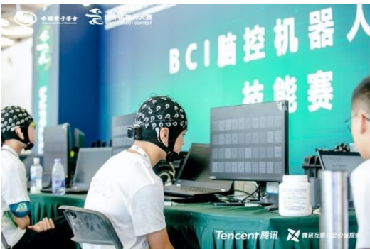
图 3 BCI 脑控机器人技能大赛