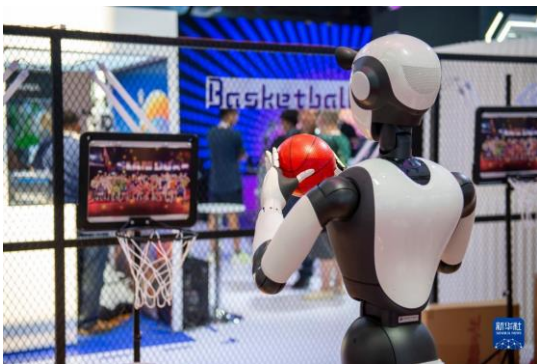
图 5 达闼科技 Cloud Ginger 人形机器人投篮