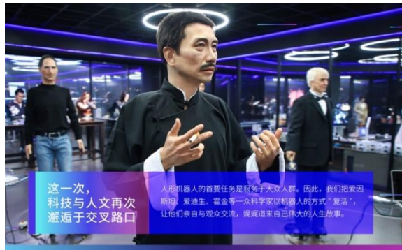
图 4 EX ROBOT 人形机器人