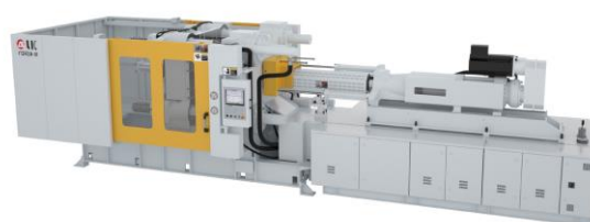
Figure 2: LK's plastic injection molding machine