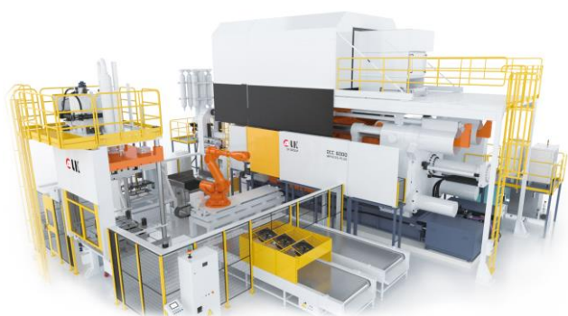
Figure 1: LK's die-casting machine