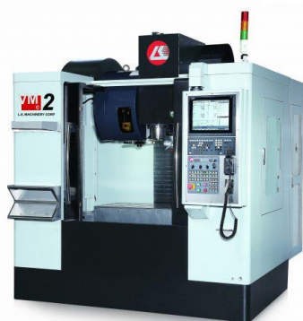
Figure 3: LK's vertical machining center