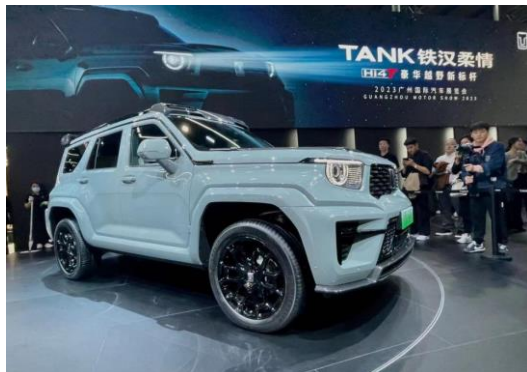
图：长城坦克700 Hi4-T 亮相广州车展