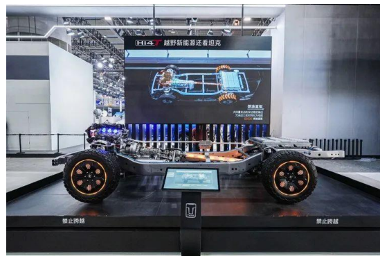
图：长城坦克700 Hi4-T 车架及底盘