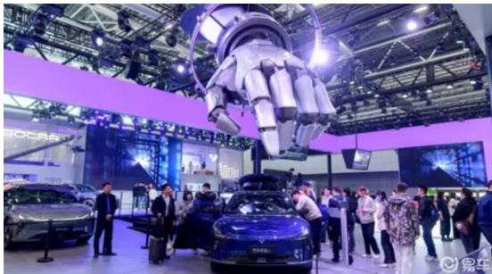
图：极越01汽车机器人亮相广州车展