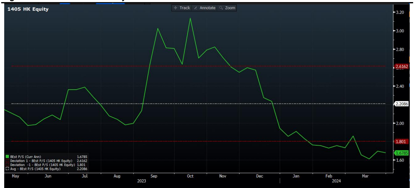
Figure 5: Valuation – forward 2 years P/S band