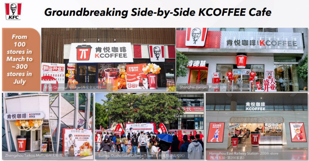
Figure 4: Image of K-coffee