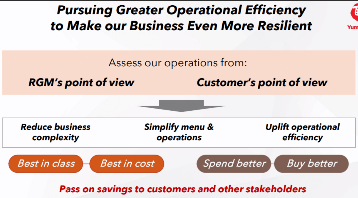
Figure 3: Yum China’s strategy to save costs and boost efficiency