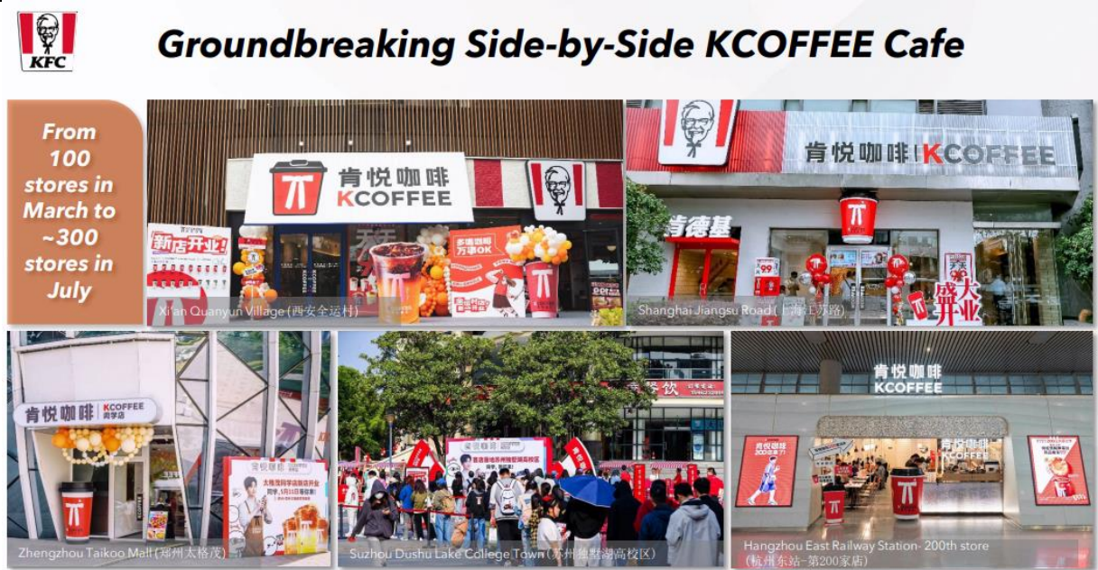
Figure 4: Image of K-coffee