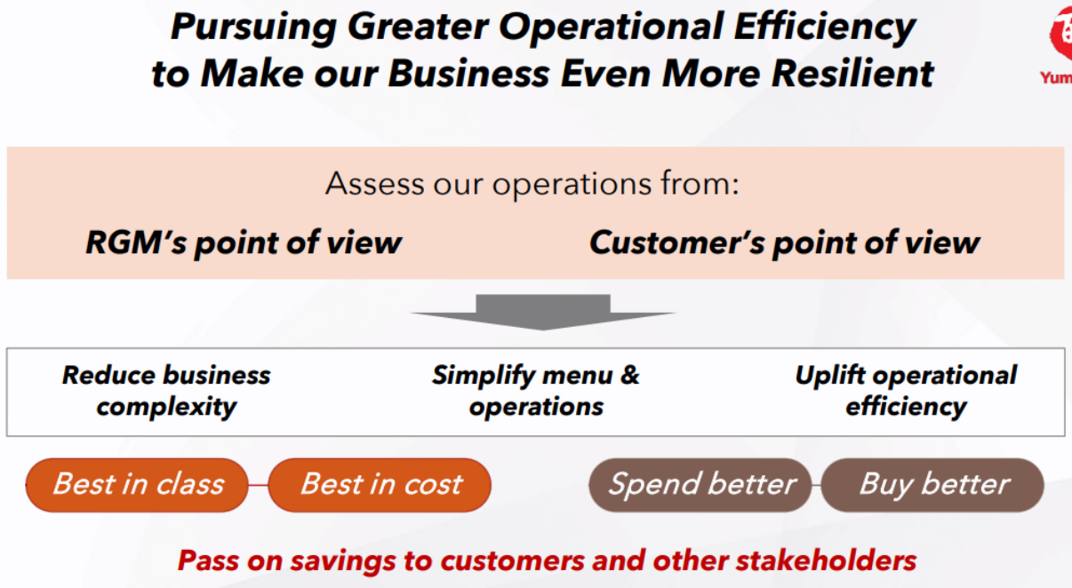
Figure 3: Yum China’s strategy to save costs and boost efficiency