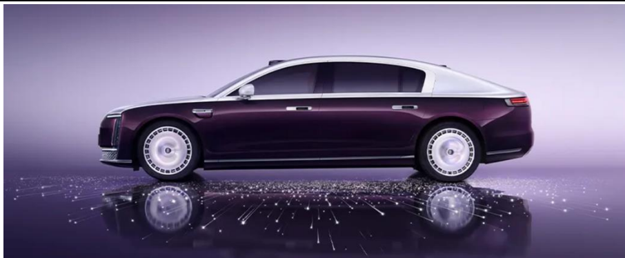
图1 尊界 S800