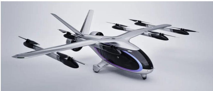
图2 高域 GOVY AirJet

12月18日，广汽集团举办广汽飞行汽车品牌暨新产品发布会，正式发布了全新飞行汽车品牌“GOVY 高域”。同时，高域首款复合翼飞行汽车 GOVY AirJet 首发亮相。