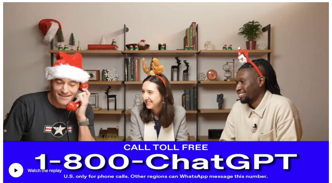
图 1 ChatGPT 热线发布