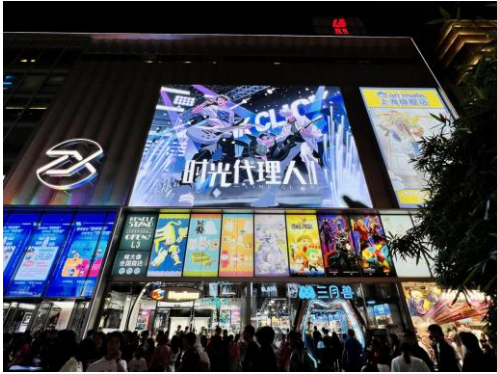
图1 百联 ZX 1 号店外观