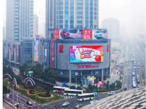
图2 百联 ZX 2 号店外观 (改造前)