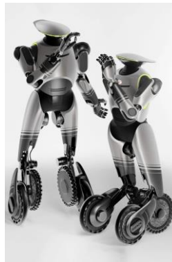
图1 广汽人形机器人 GoMate